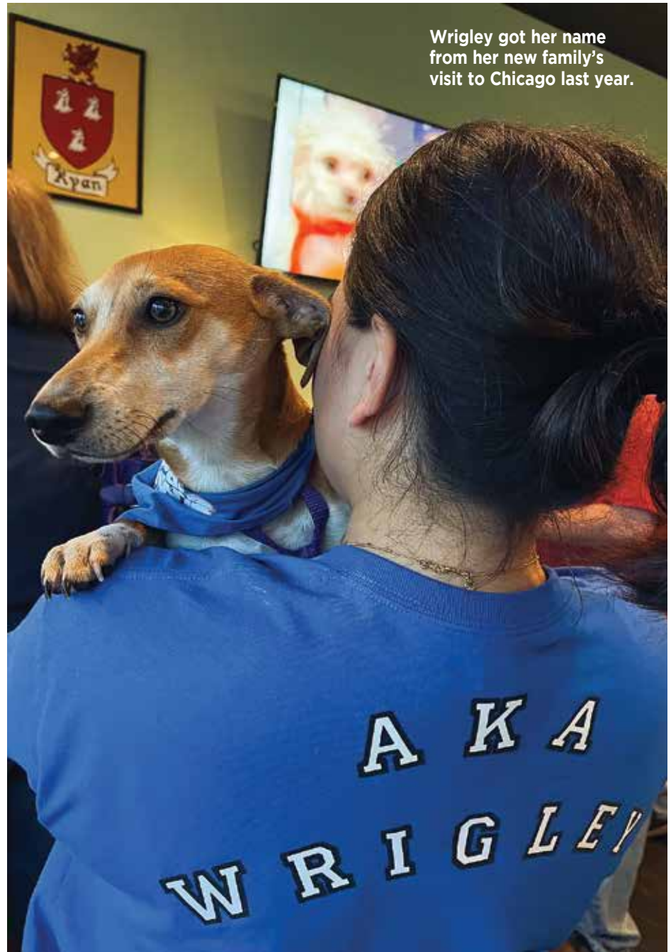
Wrigley got her name from her new family's visit to Chicago last year.

With 131 dogs participating in this year's