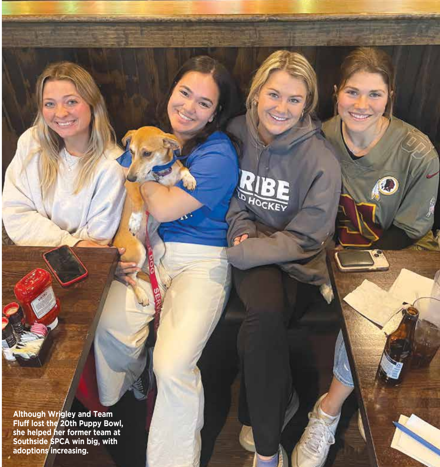
Although Wrigley and Team Fluff lost the 20th Puppy Bowl, she helped her former team at Southside SPCA win big, with adoptions increasing.