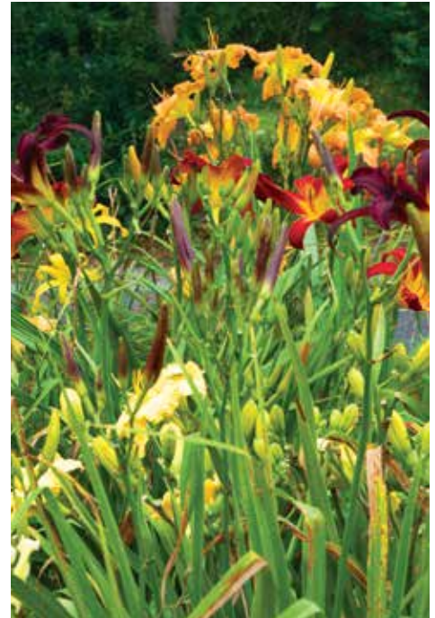
From the Ground Up