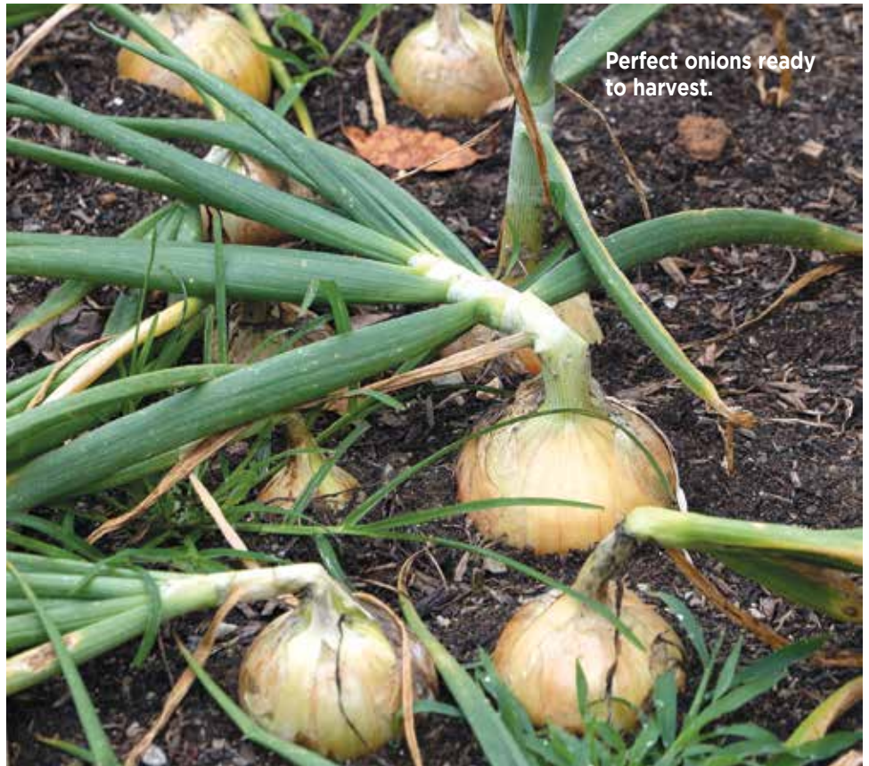
Perfect onions ready to harvest.