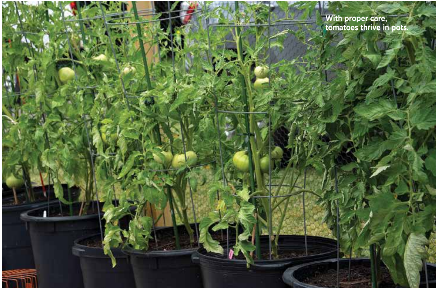
With proper care, tomatoes thrive in pots.