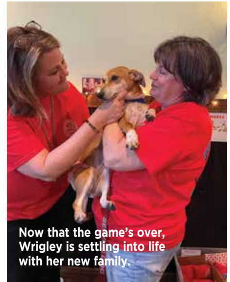
Now that the game’s over, Wrigley is settling into life with her new family.

Now, the field lights are off. The cameras are